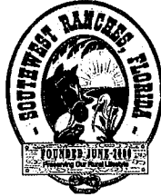
EXHIBIT "A" AGREEMENT BETWEEN THE TOWN OF SOUTHWEST RANCHES AND WEEKLEY ASPHALT PAVING, INC. FOR CONTINUING CONTRACT FOR ROADWAY REPAIRS AND TRAFFIC SIGNS MAINTENANCE SERVICES IFB No. 18-005