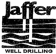
Exhibit B No. 5, 6 & 8

Jaffer Well Drilling, a Division of A.C. Schultes of Florida, Inc. 1451 SE 9th Court Hialeah, FL 33010 Dade: 305/576-7363 Broward: 954/523-6669