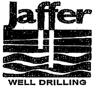
Exhibit B No. 7

Jaffer Well Drilling, a Division of A.C. Schultes of Florida, Inc. 1451 SE 9th Court Hialeah, FL 33010 Dade: 305/576-7363 Broward: 954/523-6669