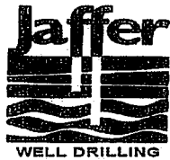
Exhibit B No. 2 & 3

Jaffer Well Drilling, a Division of A.C. Schultes of Florida, Inc. 1451 SE 9th Court Hialeah, FL 33010 Dade: 305/576-7363 Broward: 954/523-6669