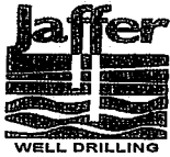
Exhibit B No. 1

Jaffer Well Drilling, a Division of A.C. Schultes of Florida, Inc. 1451 SE 9th Court Hialeah, FL 33010 Date: 305/576-7363 Broward: 954/523-8689