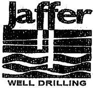
Exhibit B No. 4 & 9