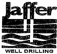
Exhibit B No. 10

Jaffer Well Drilling, a Division of A.C. Schultes of Florida, Inc. 1451 SE 9th Court Hialeah, FL 33010 Dade: 305/576-7363 Broward: 954/523-6669