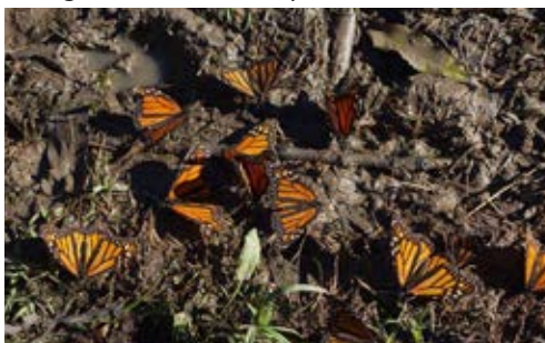
In the wild, muddy puddles can draw in many butterflies, like these monarchs. You can achieve a similar effect without getting mud on your shoes by providing a shallow bowl of water.

Some insects and amphibians will even spend most or all of their lives in a pond! For example, while dragonflies and damselflies fly around as adults, they need water to reproduce. Adults lay their eggs in or near water, and most of their life is spent underwater in the aquatic immature stage, called a nymph or larva. Some bugs, like diving beetles, will happily stay in the water even as adults. Any water feature, large or small, can make a big impact. Even a humble puddle can be an important habitat, especially to butterflies, who flock to the minerals and salts left on the surface of wet mud. These aquatic microhabitats form part of a larger network that supports biodiversity and provides refuges in urban landscapes.