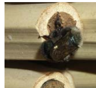
Without water to make mud, mason bees would struggle to build their nests. Placing your water source near nesting habitat, in this case cut plant stems, will make it easier for bees to begin reproducing in your yard