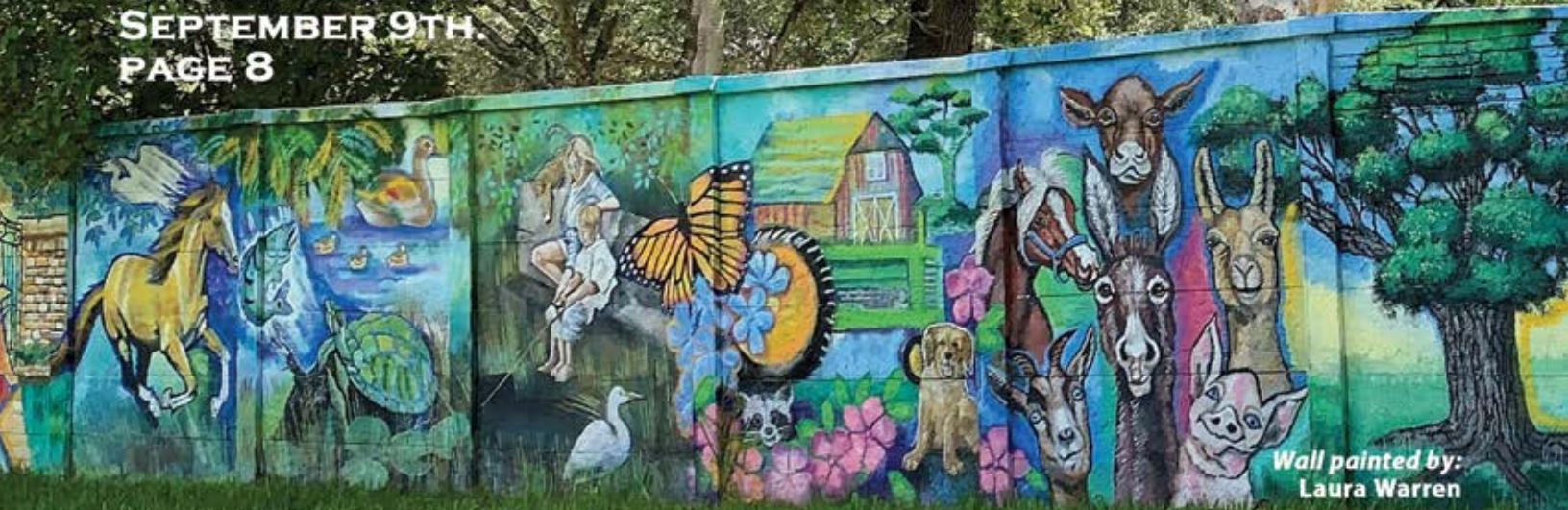
Wall painted by: Laura Warren

2025-26 PHOTO CONTEST SUBMITTAL DUE SEPTEMBER 9TH. PAGE 8