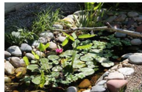
A gently sloping stone shoreline and aquatic plants for perching, roosting, and laying their eggs, makes this backyard pond wonderful for dragonflies.