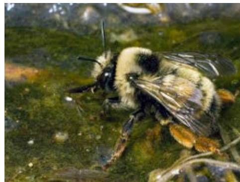
Bees of all sorts, including bumble bees, and this very convincing, bumble-bee-mimic digger bee ( Anthophora bomboides ) need to visit water sources to drink. (Photo: Sean McCann).

Since many native bees and wasps will resort to collecting water from puddles and ditches when other sources are unavailable, they can run the risk of exposure to harmful pollutants and pesticides. Providing a shallow source of unpolluted water for bees and wasps can improve their overall chances of nesting successfully by reducing the time they need to forage, as well as their risk of exposure to pesticides.