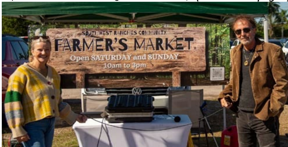
Antonio and Audrey Salciccioli

There are some other dates you may want to add to your calendar. In last month's Southwest Rancher, (continued on page 5)