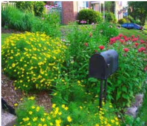
Replacing lawn with native plants can create a beautiful and welcoming landscape for people and wildlife alike.

No-Mow May is a trend that has been gaining steam among gardeners, encouraging those with lawn space to opt for low or no mowing practices throughout the month. Reducing mowing during this time can provide a few benefits for wildlife if the lawn includes a large number of noninvasive wildflowers to benefit pollinators. Unfortunately, most lawns are comprised only of non-native turf grasses which provide very little benefit to wildlife. However, it is noteworthy that carbon emissions can be heavily reduced by keeping the mowers across the country turned off for a month, considering that running a lawn mower for just one hour can create the same amount of pollution as a 100-mile car trip! While reducing the amount that you mow can be a great first step, to really help wildlife including bees, butterflies, and birds, we recommend opting for replacing lawn with native species and managing any remaining lawn intentionally. Luckily, this process of lawn reduction and intentional management is much easier than you may think, and there is no need to sacrifice aesthetics in the process! Plus, you are in great company as the percentage of people planning to transform a portion of lawn to wildflower native landscaping more than doubled from 9% in 2019 to 19% in 2021. (National Garden Association and National Wildlife Federation)