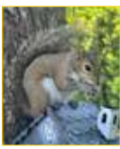
Just having a snack .(From the 2024 Photo Contest Calendar)