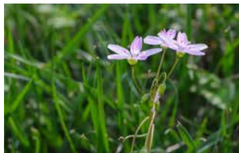
Spring beauties (pictured here) and native violets are great examples of native flowers that actually do very well in lawns and have great wildlife benefits.

• Consider native turf-grass alternatives when possible. Replacing non-native turf doesn't always mean you have to get rid of green 'lawn' space. Native mosses can provide a lush green alternative and, depending on where you live, there may be some grasses native to your region that can be mown to function similarly to a traditional 'lawn'.