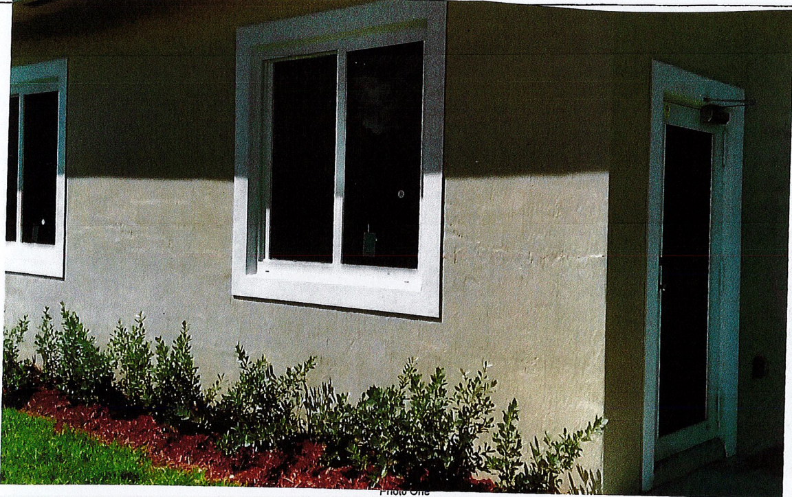
Photo One Caption Front View 9-17-2022 Clear Photo One

If using the Elevation Certificate to obtain NFIP flood insurance, affix at least 2 building photographs below according to the instructions for Item A6. Identify all photographs with date taken; "Front View" and "Rear View"; and, if required, "Right Side View" and "Left Side View." When applicable, photographs must show the foundation with representative examples of the flood openings or vents, as indicated in Section A8. If submitting more photographs than will fit on this page, use the Continuation Page.