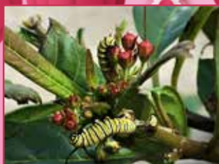
"MUNCH MUNCH" (From the 2024 Photo Contest Calendar)