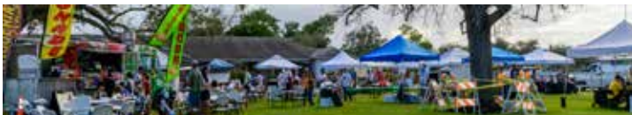
2023 SoFlo Chilifest and Car Show event December 9th at Rolling Oaks Park was a huge success and a fun filled day.