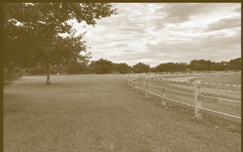
PHOTO BY: Kyle Bennett "Our Open spaces in Southwest Ranches are surreal." (From the 2022 Photo Contest Calendar)