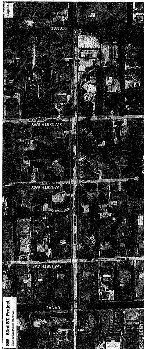
Figure 1: Location map