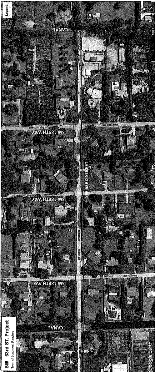
Figure 1: Location map