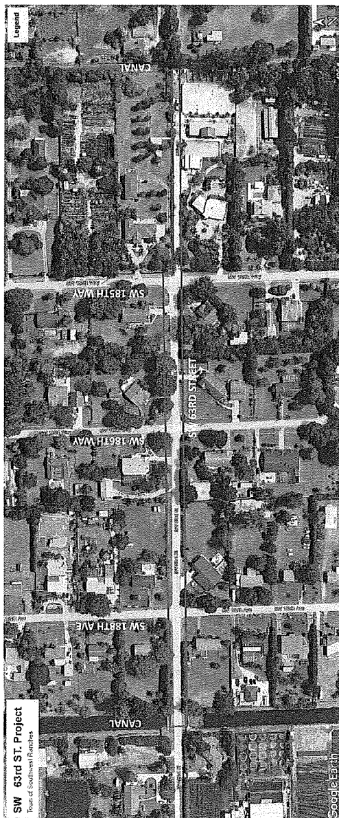
Figure 1: Location map