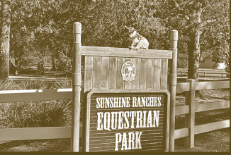
"Kisses, the goat, at the Equestrian Park." (From the 2022 Photo Contest Calendar)